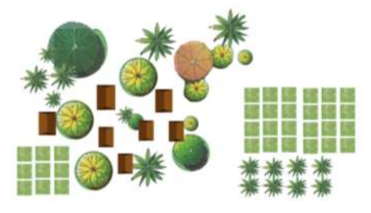
Figure 4 Semi-Cluster Settlement Pattern

2. The semi- cluster settlement pattern is to establish a small village which lower density, house is separated from the agricultural areas.