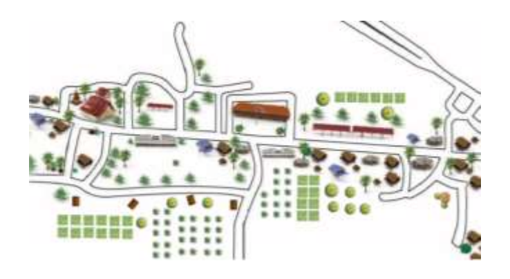
Figure 3 Cluster Settlement Pattern

1. The cluster settlement pattern is to locate the houses next to each other which performed the high the density village plan that located.